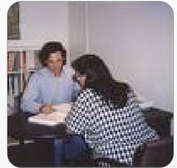
Across the country, accessing legal aid is getting more difficult.

The Kamloops bar made the decision to voice their opposition to massive reductions in services offered by the Legal Services Society of BC (LSS). In November, LSS announced their plans to shut down the LawLINE, the Community Advocate Support Line, and regional legal aid offices in Kamloops, Kelowna, Prince George, Surrey, and Victoria as of March 31st, 2010.